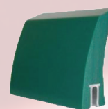
Chemical/Acid Resistant Green 80A