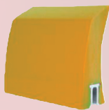
FDA Polyurethane Natural 85A