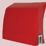
Heat Resistant -40 to 300 °F Red 95A