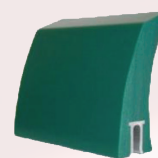
Chemical/Acid Resistant Green 80A