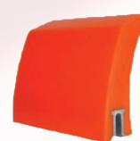
Solid Polyurethane Orange 90A